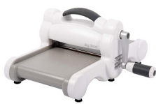
SIZZIX BIG SHOT