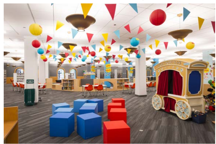
Chicago Public Library's Thomas Hughes Children's Library inside the Harold Washington Library Center