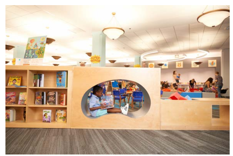
Chicago Public Library's Thomas Hughes Children's Library inside the Harold Washington Library Center

Located on the second floor of the iconic <u>Harold Washington Library Center</u>, this children's library blends a STEAM approach with traditional library services. There's an interactive puppet stage and story nook for little ones, and plenty of STEAM-focused events and learning activities for kids. Tweens will love exploring the digital media space where they can learn how to use laptops, cameras, keyboards and virtual reality tools. During the school year, a teacher is present to answer questions and offer homework help.