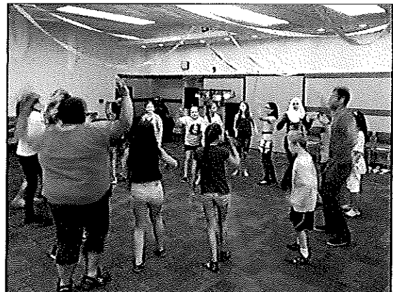
Volunteer Pizza Party