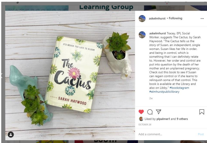
Sample Bookstagram from October 29.

Marketing also started a new social media campaign, Bookstagrams on Instagram. Books featured on our What We're Enjoying Wednesday program are attractively photographed (and made Insta-worthy) and the recommendation made by the staffer is written up, too. It is a way to give another life to the work our staff put forth in their recommendations. We hope to make Bookstagrams a weekly addition to the Library's online presence.