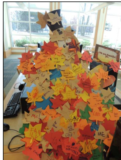
We are thankful for...