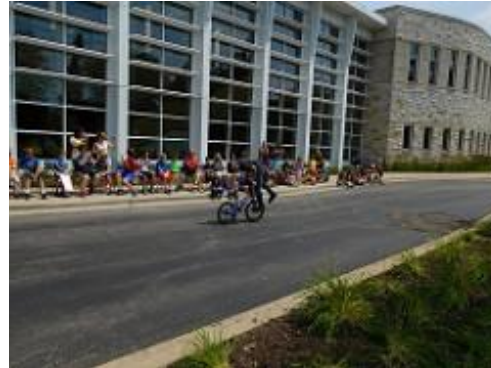
BMX Sports Hero