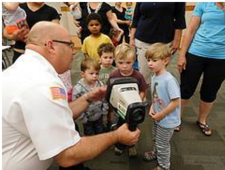
Hometown Heroes Storytime

Images are copyrighted. Contact the CSLP at 1-866-657-8556 or info@cslpreads.org for more information.