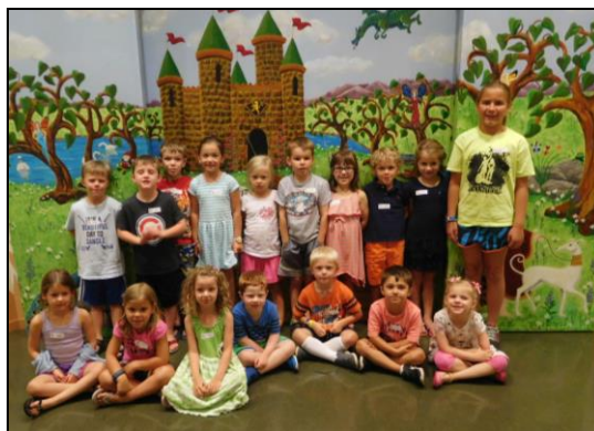
Get Ready, Get Set, Read! First Graders