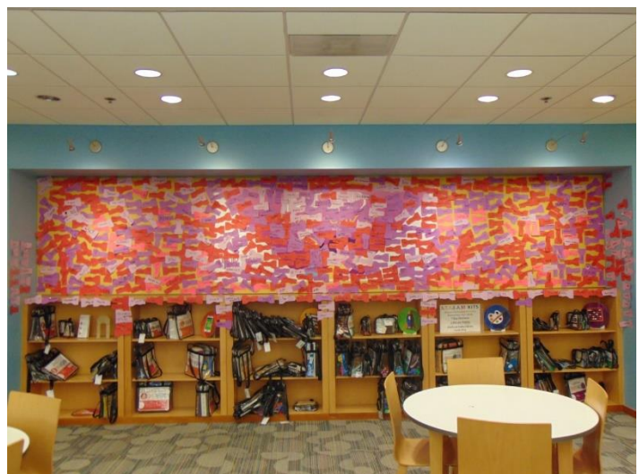
Our bulletin board full of WRP flashlights from all our winter readers.