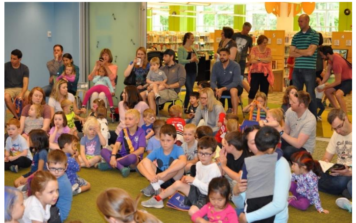
The Puppets On the Wilder Side puppet shows drew big crowds on Summer Reading Kick Off Day.