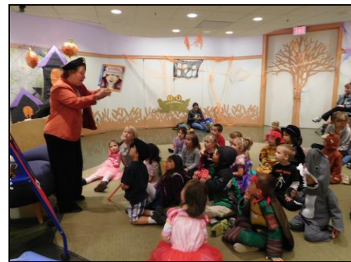
Road to Reading Halloween stories