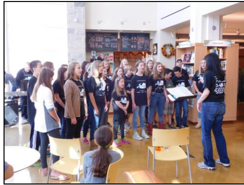
Footloose Cast Performance in the Lobby