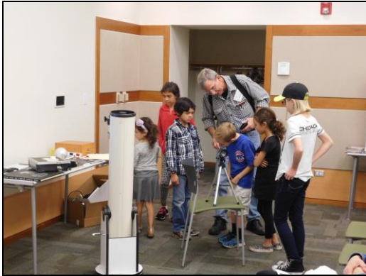
The Moon Up Close – without the moon