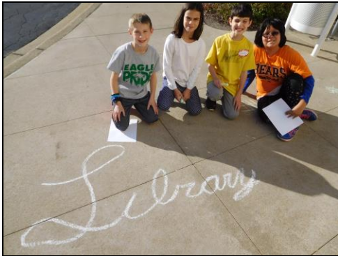
A few of the kids from the Cursive Writing Class