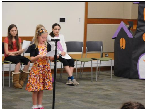
Scary Story authors perform