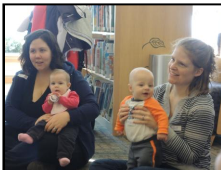
Chicka Chicka Baby