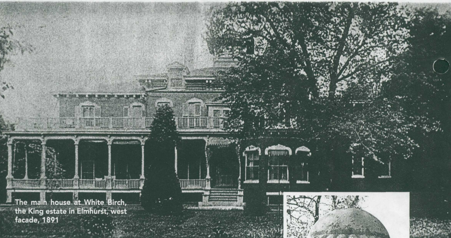
The main house at White Birch, the King estate in Elmhurst, west facade, 1891