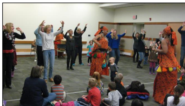
West African Dances