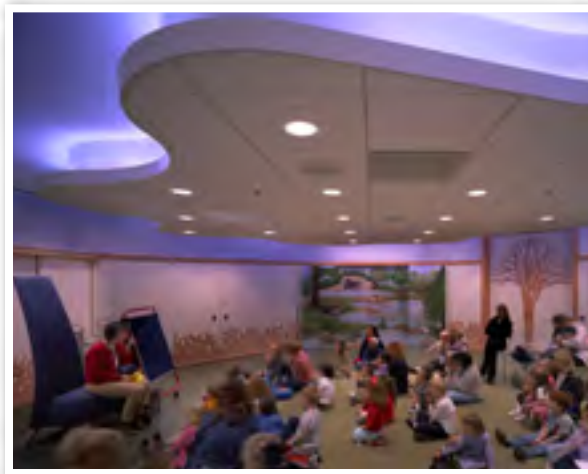
Photographs © 2003 David B. Seide: Defined Space, Chicago

Advanced registration is not required for "drop-in" programs. A valid Elmhurst Public Library card must be presented at the Help Desk to be admitted.